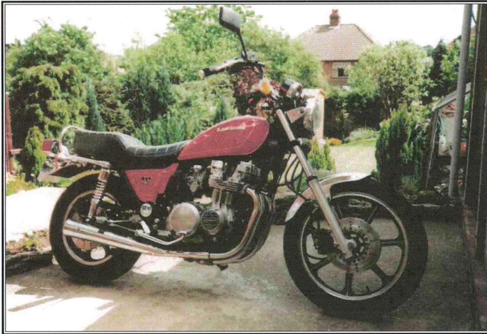
My Pride and Joys