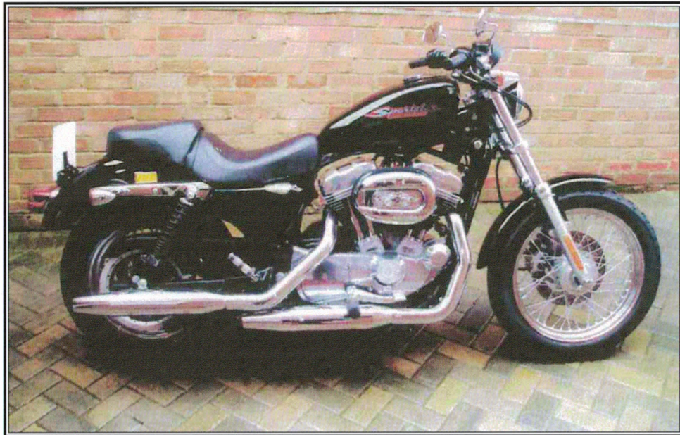
I always said I'D get a Harley

Entry of Coffin to Dance The Night Away by The Mavericks